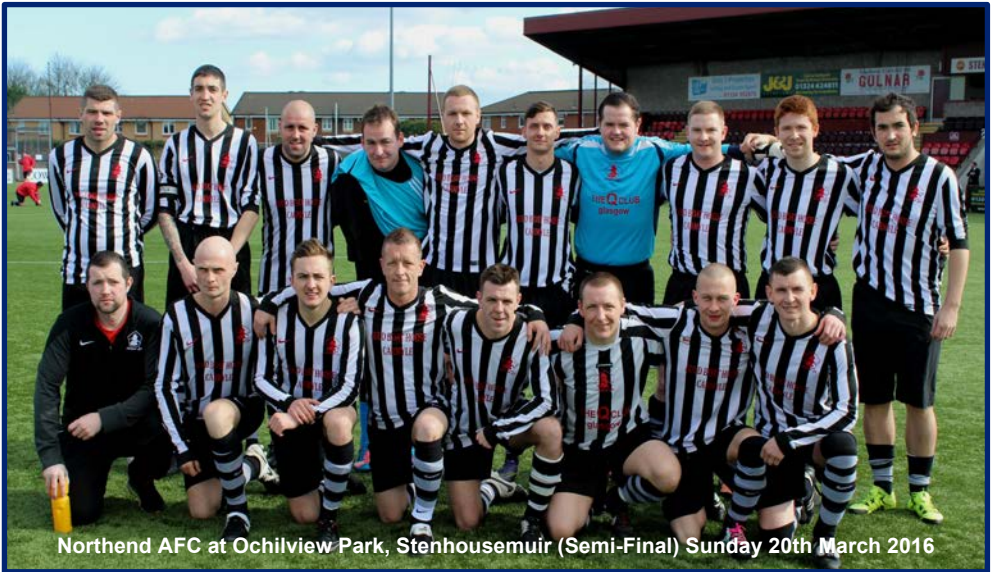
Northend AFC at Ochilview Park, Stenhousemuir (Semi-Final) Sunday 20th March 2016