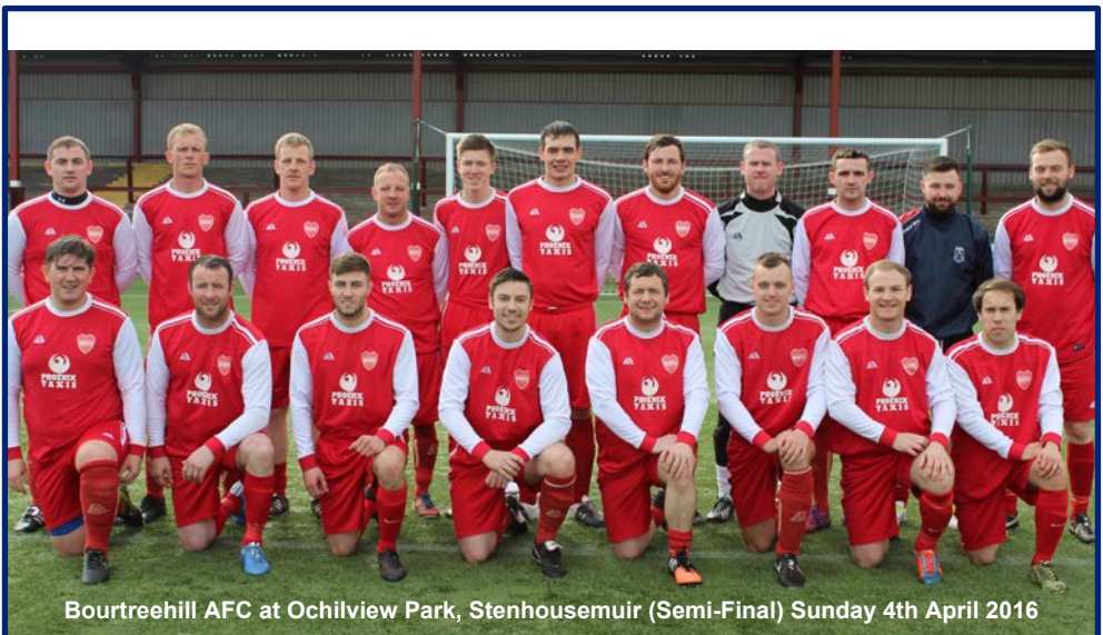
Bourtreshill AFC at Ochilview Park, Stenhousemuir (Semi-Final) Sunday 4th April 2016