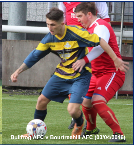
Bullfrog AFC v Bourtrees Hill AFC (03/04/2016)