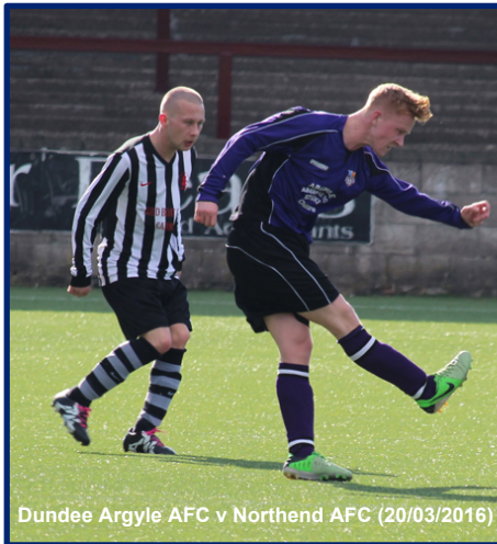
Dundee Argyle AFC v Northend AFC (20/03/2016)